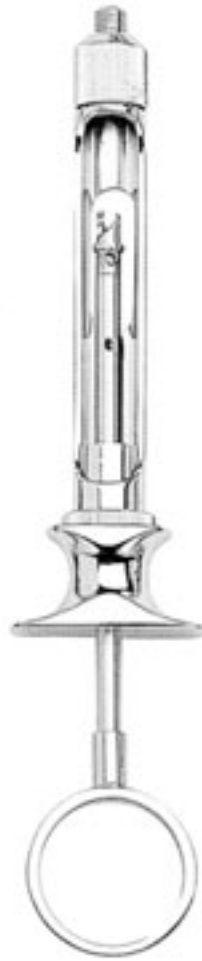
F 5366 F 5366S satin