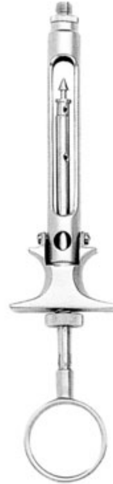
F 5366/1S satin - 1,8 ml F 5366/2S satin - 2,2 ml