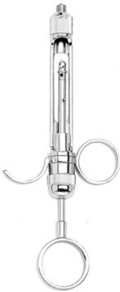
F 5391/1 F 5391/1S satin