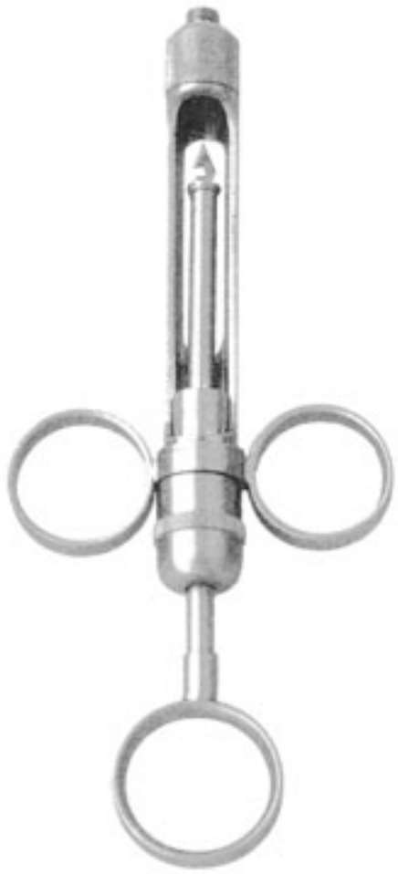
F 5391 F 5391S satin